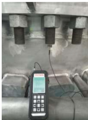
Ultrasonic Elongation for Coupling Bolt Tightening