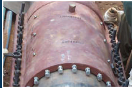
20" EPOXY CLAMP UNDER INSTALLATION