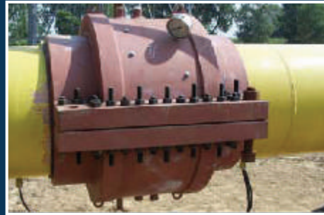
24" #600 IJ CLAMP UNDER INSTALLED AT GAIL