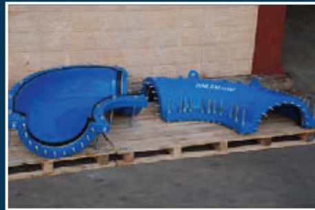
20" NB BEND CLAMP