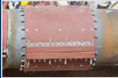
24" X 12" TEE CLAMP INSTALLED