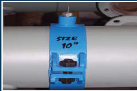
PIN HOLE CLAMP